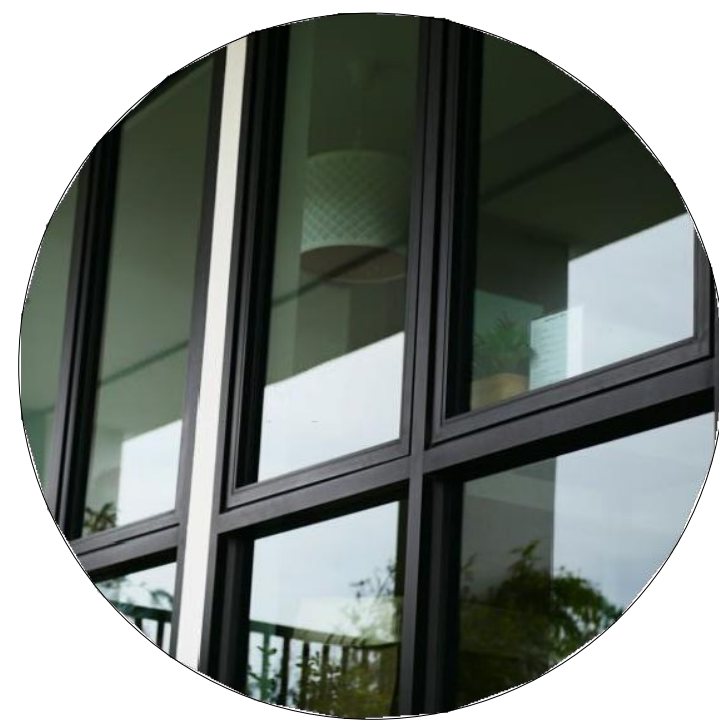
4 TINTED GLASS FOR STOREFRONTS, WINDOWS, BALCONY DOORS VIRACON - 9/16" VLE24 - 47 LAMINATED HS/HS