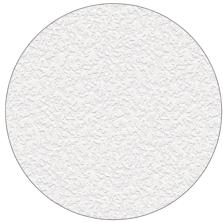
1 SMOOTH STUCCO FINISH DRYVIT - SLIM FINESSE 310ST CHINA WHITE