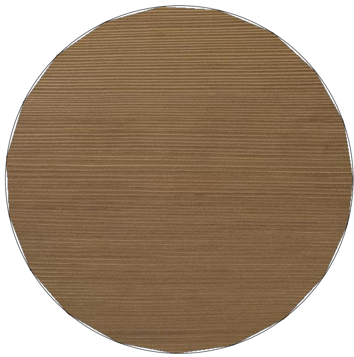
3 WOOD-POLYPROPYLENE COMPOSITE KNOTWOOD - FRENCH WALNUT