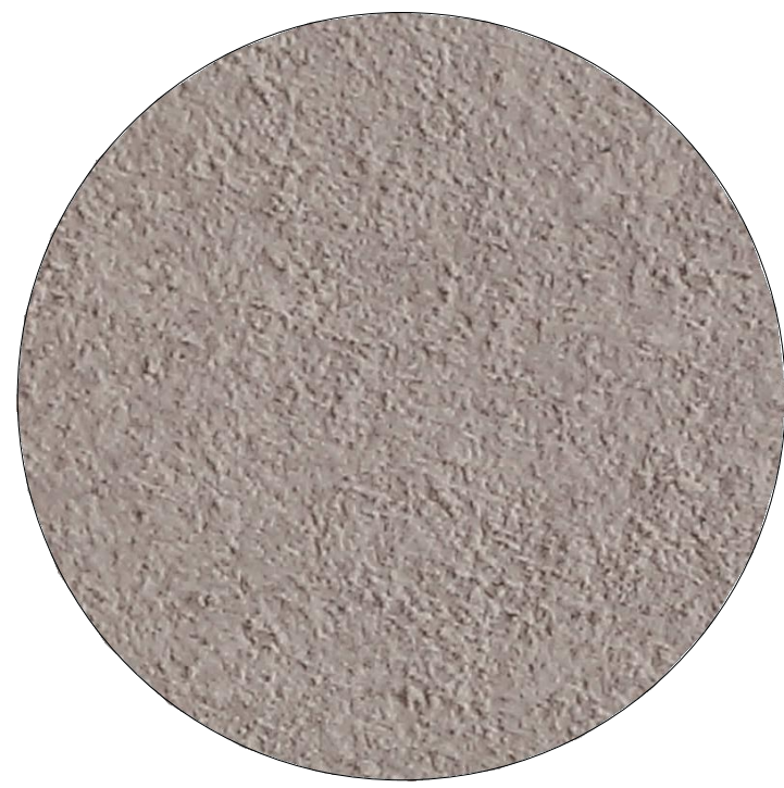
2 SMOOTH STUCCO FINISH DRYVIT - SLIM FINESSE 105ST SUEDE