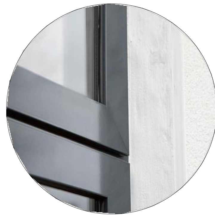
5 ALUMINUM FRAME FOR STOREFRONTS & WINDOW BENJAMIN MOORE 2134-30 IRON MOUNTAIN